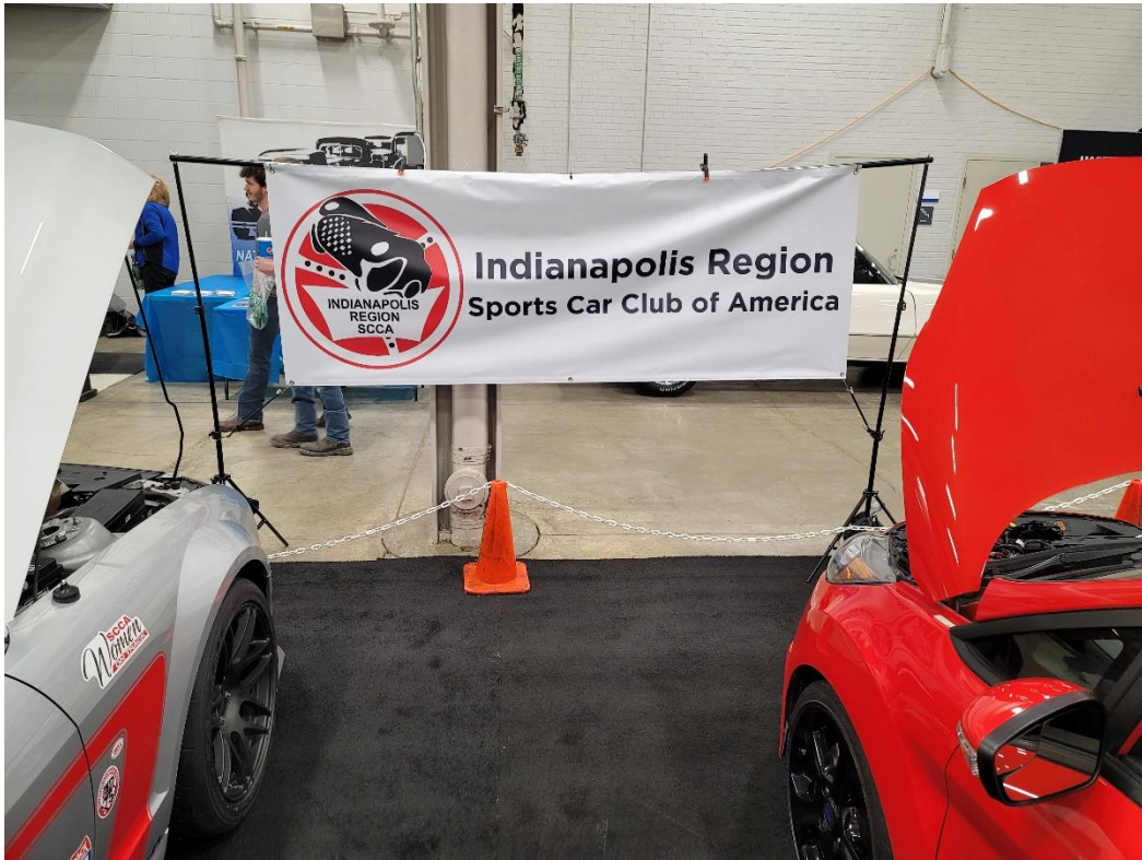
The Indy booth at the World of Wheels in 2023