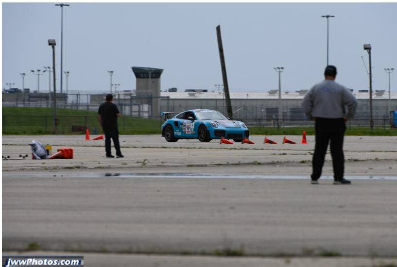
2022 One Lap Workers at Grissom

Ads in the "For Sale" part of the Clutch Chatter are "Free" to members.