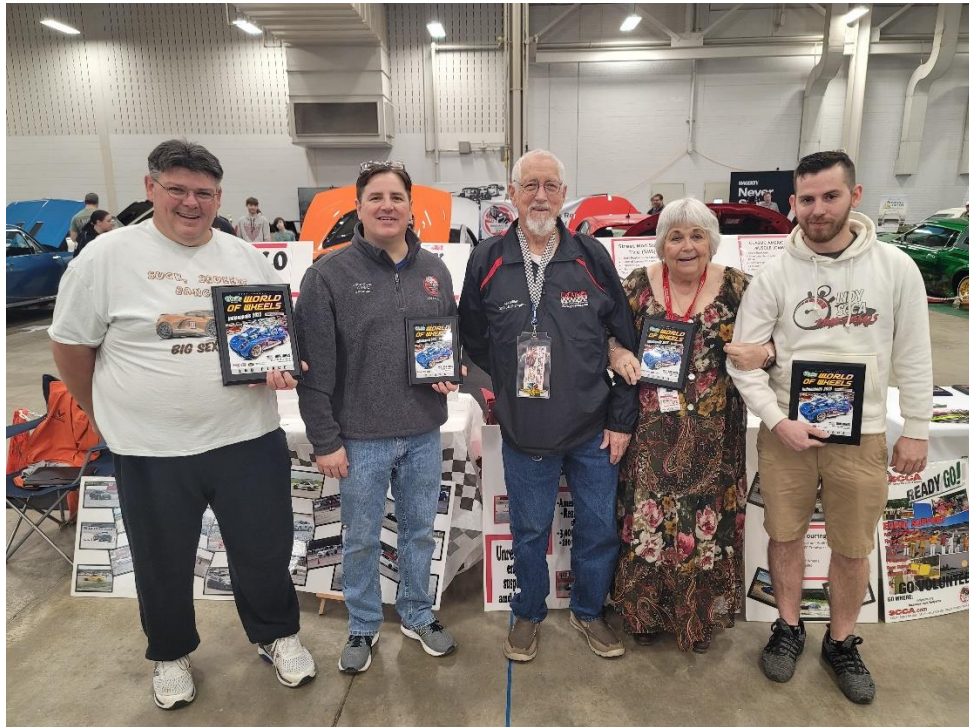
All four of the Indy Region cars took awards at the 2023 World of Wheels Show