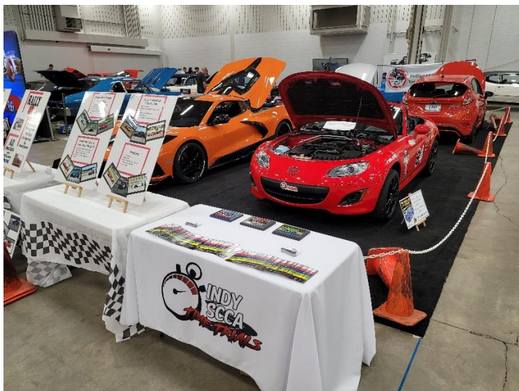
The Time Trial table at the World of Wheels